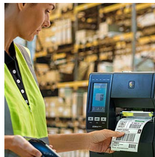
Browse Industrial Printers...