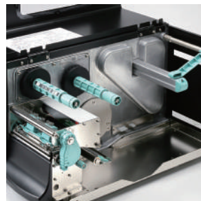
All metal, industrial enclosure and print mechanism