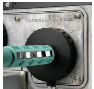
Automatic self adjustment for coated inside/outside ribbons