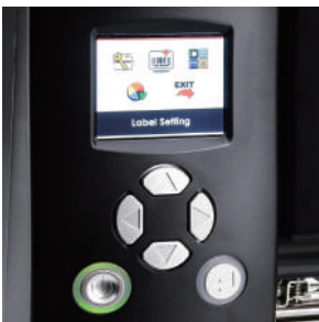
Color TFT LCD and operation panel for easy and intuitive operation

All metal mechanism design featuring die-cast center plane and base make EZ2250i series perfect for high volume applications